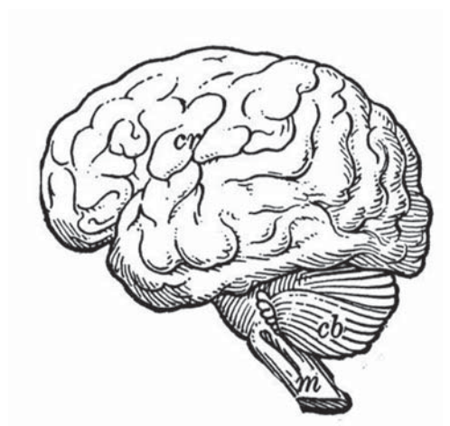
Living in sin we build bridges in our minds—bridges of wrong habits, attitude, responses, and ways of thinking.

How is the mind (our thinking) made new?