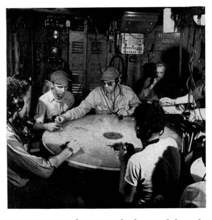
Do we understand the spiritual application? Are we looking at this war between Satan and God as an observer?

A strategy is the method to obtain the objective. The Allies knew that the military on the mainland of Japan was too difficult to attack from a distance. And Japan was increasing it's dominion over the