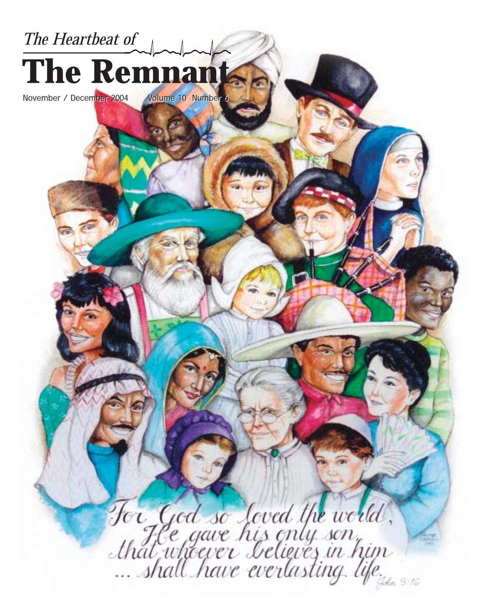
... is Others, Lord, Yes Others