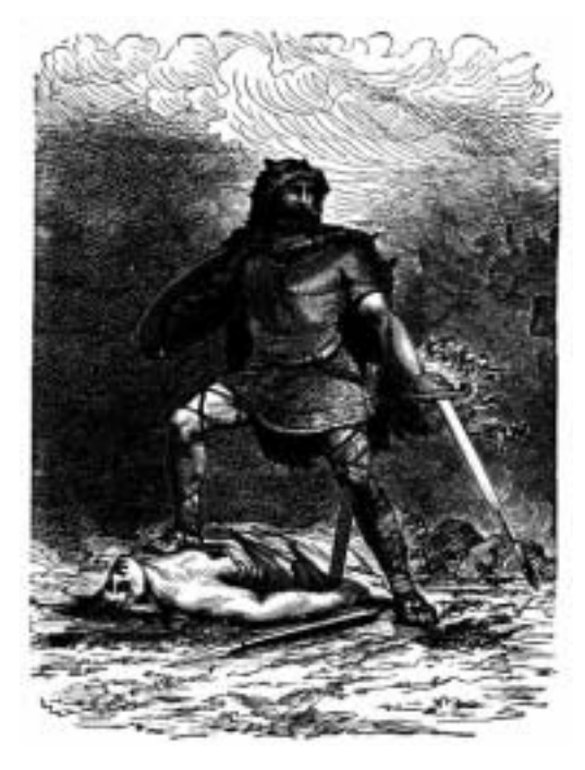
We wrestle against